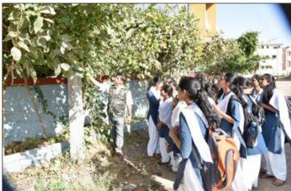
Field visit during one day workshop.