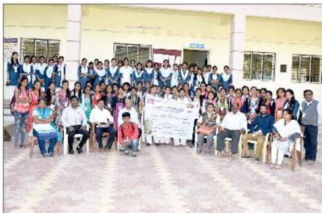
One day workshop participant group photo.