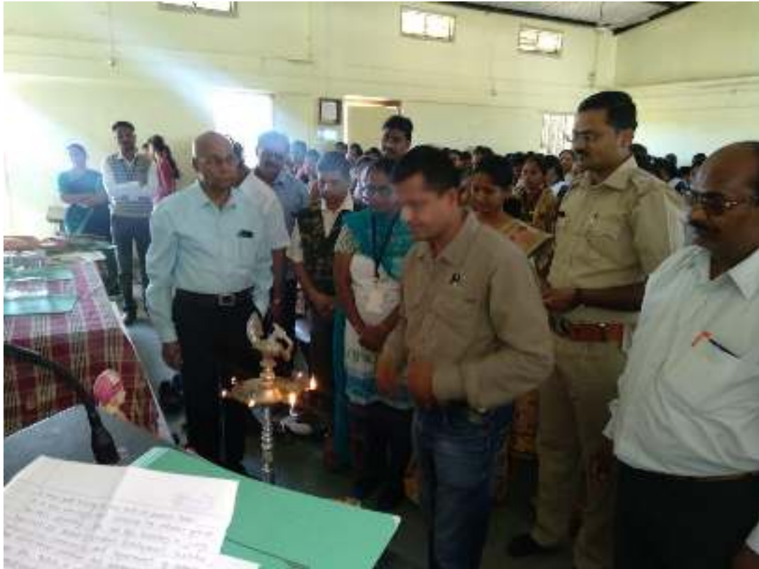
Inauguration of one day workshop program by resource person and principal.