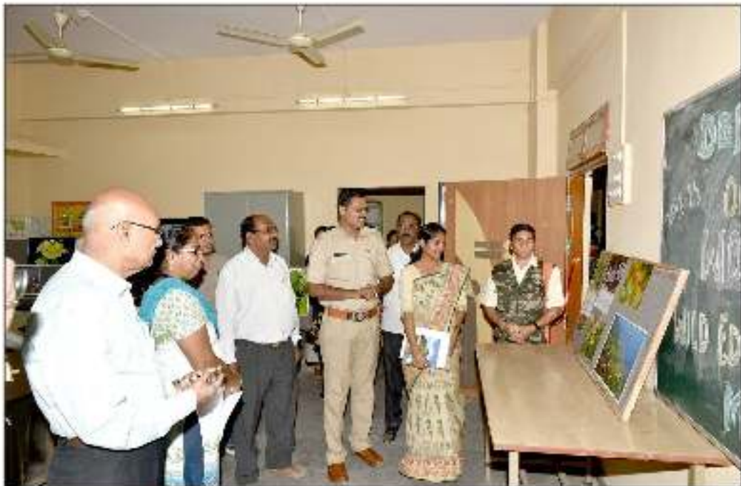
Visit to medicinal plant display